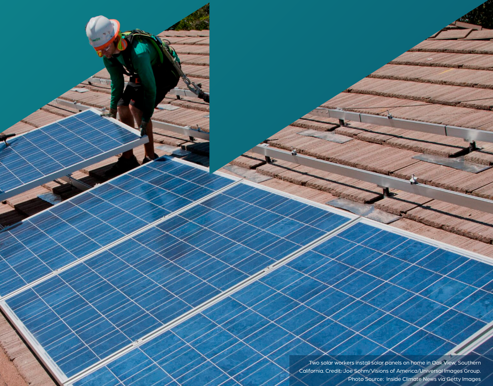
Two solar workers install solar panels on home in Oak View, Southern California.

If you have questions, email: info@californiaforenergyindependence.com